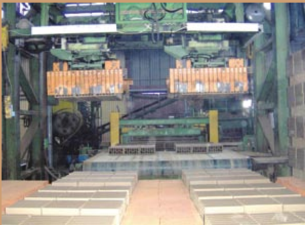
Manufacturing Equipment at The Ceramic Factory - Botevgrad

Faced with record growth in its industry, The Ceramic Factory – Botevgrad ensured it could control costs as well as it could control its furnaces and transportation line by selecting ICONICS' software solutions. With GENESIS32 and ReportWorX, the construction materials supplier is building a firm foundation for its own future.