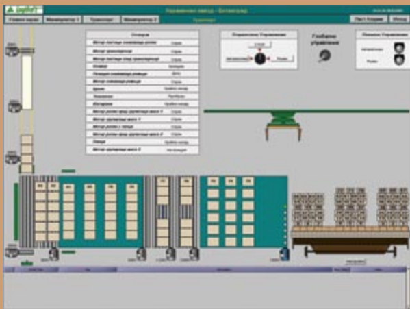
A Factory Control Screen at The Ceramic Factory