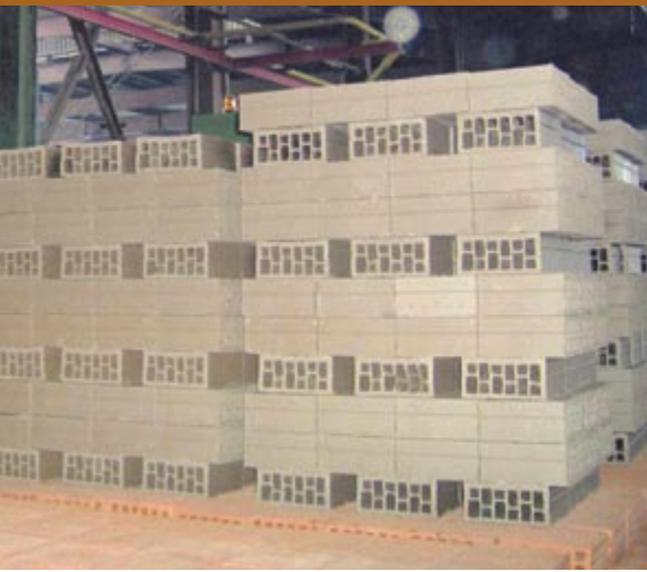
Bricks in Storage at The Ceramic Factory – Botevgrad