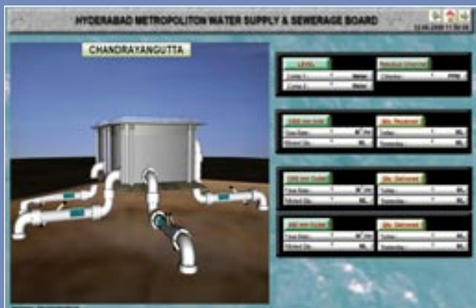
Overview of the Chandrayangutta Tank