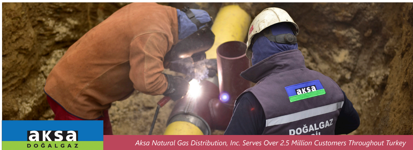
Aksa Natural Gas Distribution, Inc. Serves Over 2.5 Million Customers Throughout Turkey