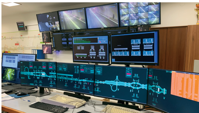
Autocesta Zagreb-Macelj Command Center

The Autocesta Zagreb-Macelj needed an advanced system that could enhance the existing SCADA and that could