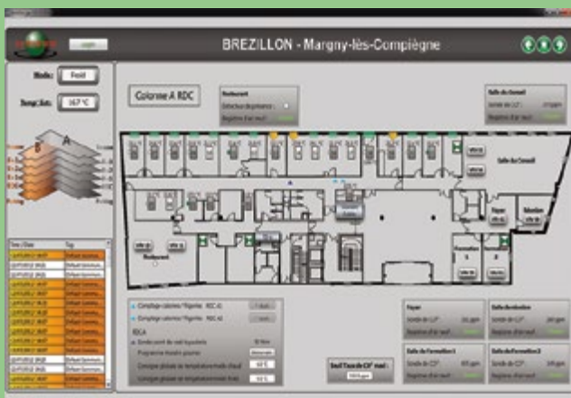
Building Temperature and CO2 Monitoring

ICONICS was able to help Brézillon, CR System and BETHIC meet their Grenelle de l'environnement compatibility requirements. Future plans include expansion of the system into energy monitoring and preventive maintenance, with the goal of reducing energy consumption and greenhouse gas emissions.