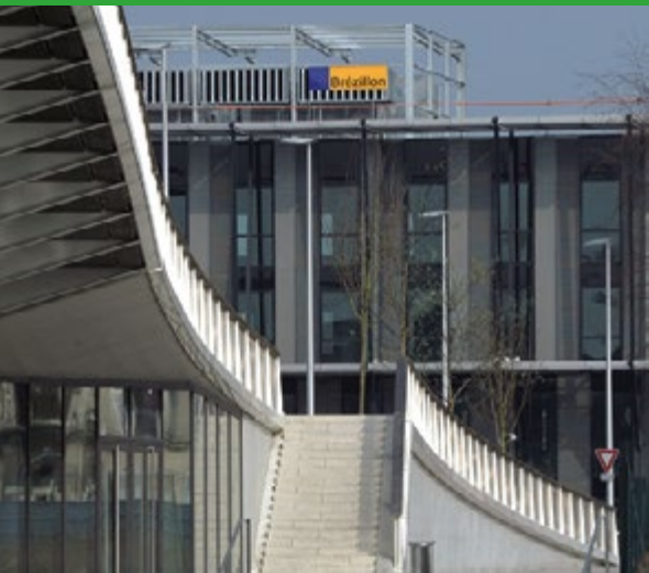
Brézillon Headquarters in Margny-lès-Compiègne, France