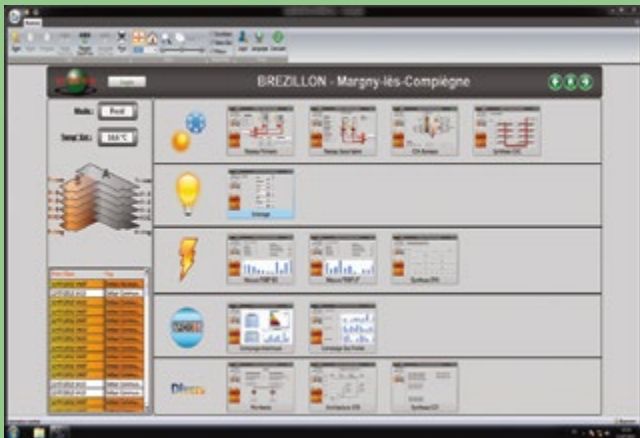
A Brézillon Building Control Screen Created with GENESIS64™