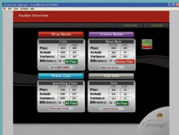
A Cyberlogic Bottling Process Screen