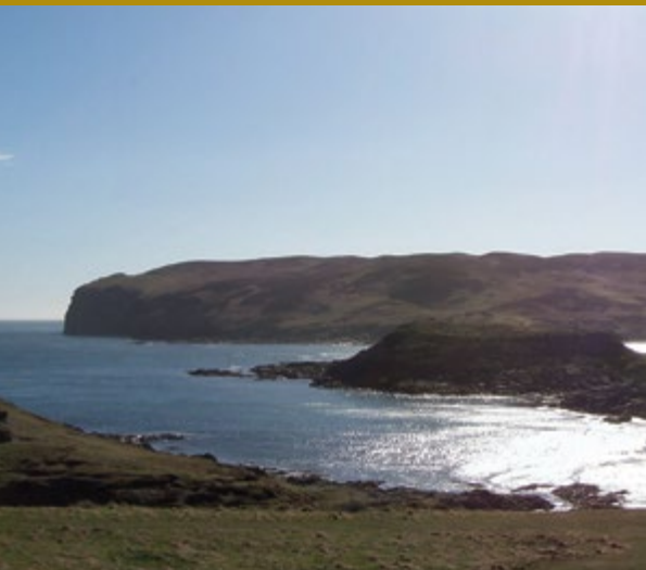
The Shores of Isle of Man, United Kingdom