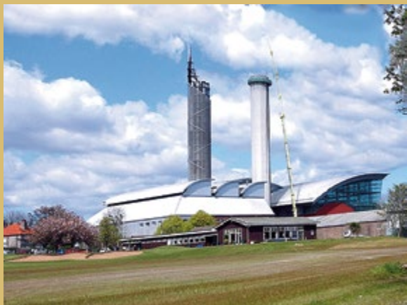
Pulrose Power Station