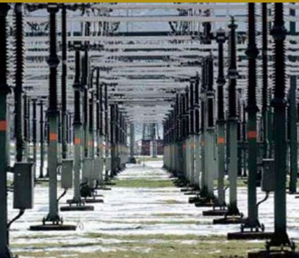
Power Transmission Lines in Switzerland