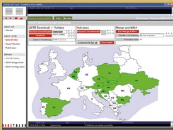
DACF System Monitoring and Control