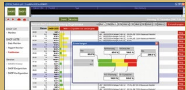
Security Forecast Screen

highly specialized custom blocks. Tight collaboration between the BizViz business visualization and GENESIS32 HMI/SCADA suites, ease of configuration, and superior graphical interfaces were also motivating factors.