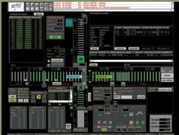
Roll Transporter System Monitor at Vitkovice Steel

The system picks the overall production settings from the superior PPS system. The KSUP system automatically registers all the key parameters of individual production operations and stores them in the Oracle database.