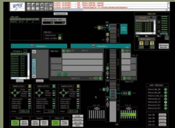
Manufacturing Monitoring Screen

9.2 data base, UZ line-over databases, stampers in hot or cold conditions (3964R), and paint stampers is seamless. The ICONICS solutions also connect easily to the company’s existing Microsoft products, including Windows 2003 Server, Windows 2000 and XP clients, Microsoft Office and SQL databases.