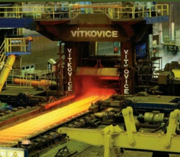
Vitkovice Steel's 3.5 Meter Four-High Rolling Mill